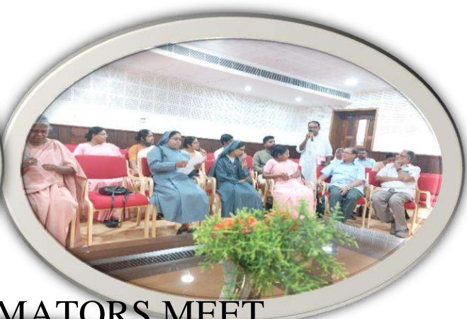
ZONAL ANIMATORS MEET