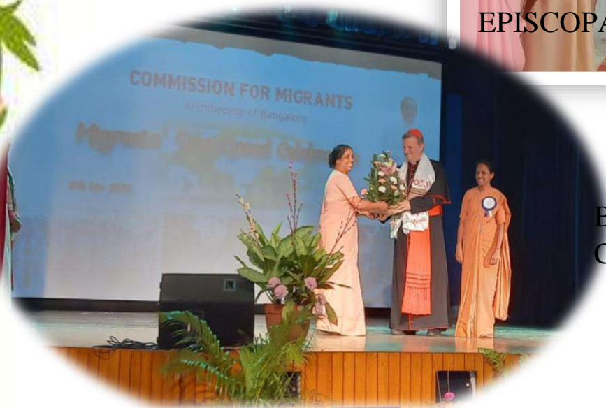
BCRI PRESIDENT GREET CARDINAL MARIO GRECH